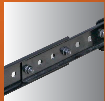
· mobile base is adjustable to different sizes