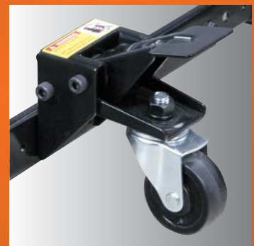
· easy to handle foot-operated parking brake