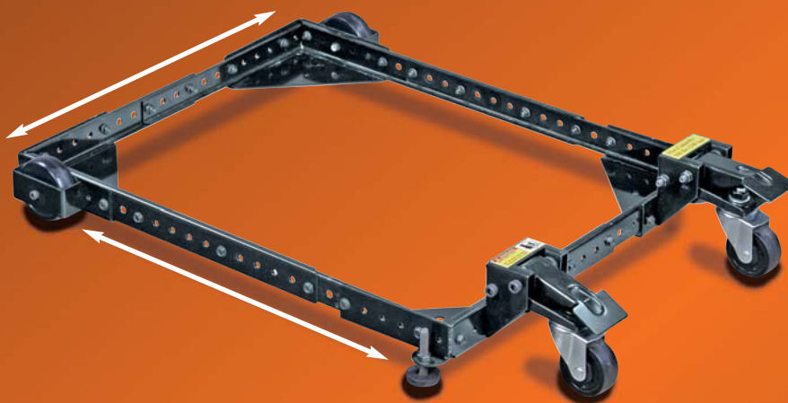
· extendable by using the hole pattern