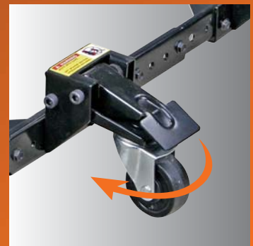
· rotatable by 360°